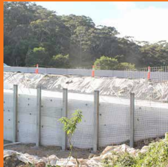
Mount Ousley Project New South Wales - RMS