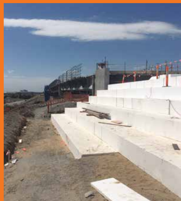
Port of Brisbane Upgrade - Seymour Whyte