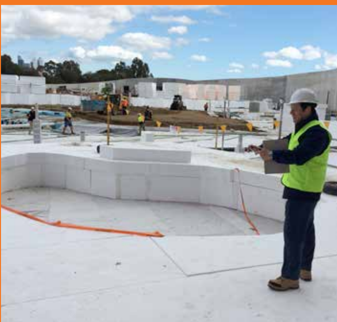
Crown Casino Western Australia - Brookfield Multiplex