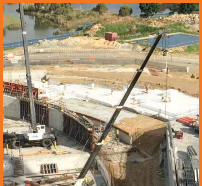
Crown Casino Western Australia - Brookfield Multiplex