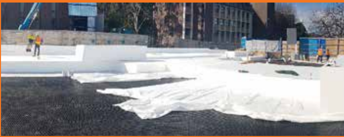
Monash University Victoria - Brookfield Multiplex

Madama Butterfly New South Wales - Red Circle Projects