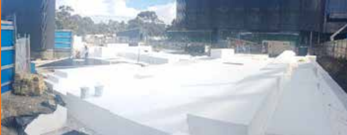
Monash University Victoria - Brookfield Multiplex