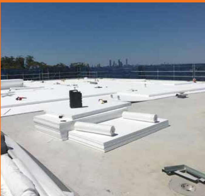
Commonwealth Games Village Gold Coast - Grocon