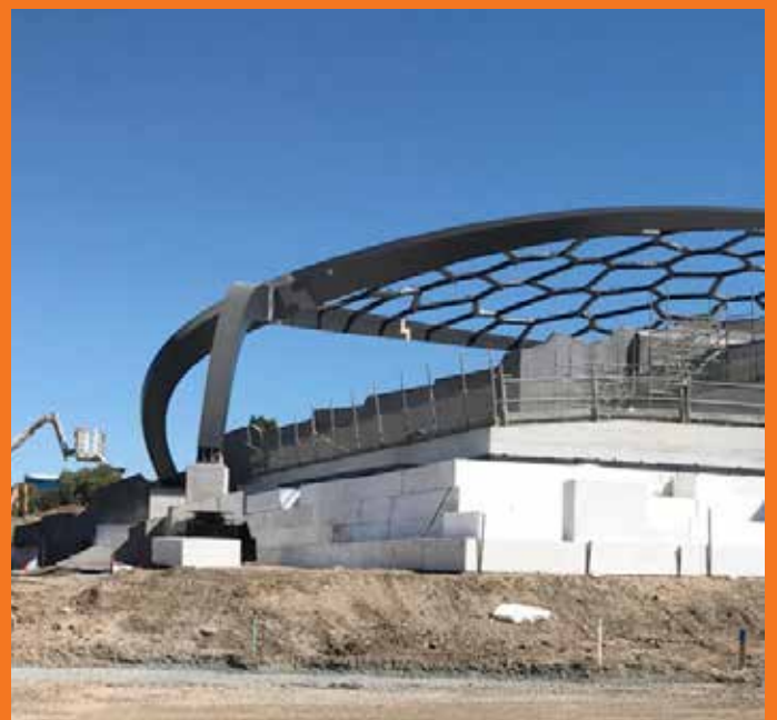
Cultural Precinct Gold Coast - ADCO